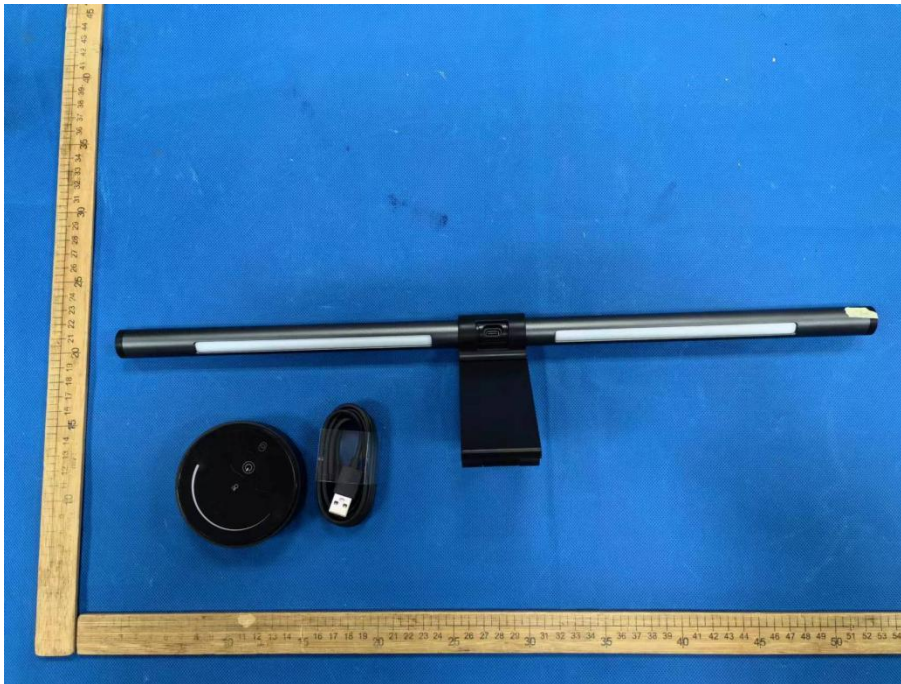
Figure 1: Outlook view