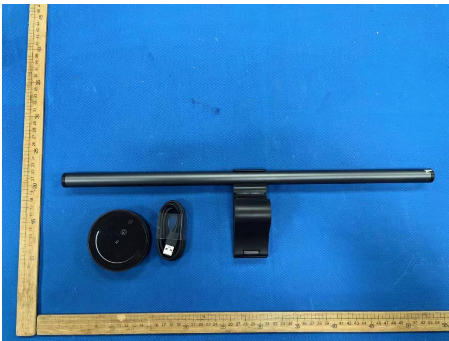
Figure 2: Outlook view ---End of Report---